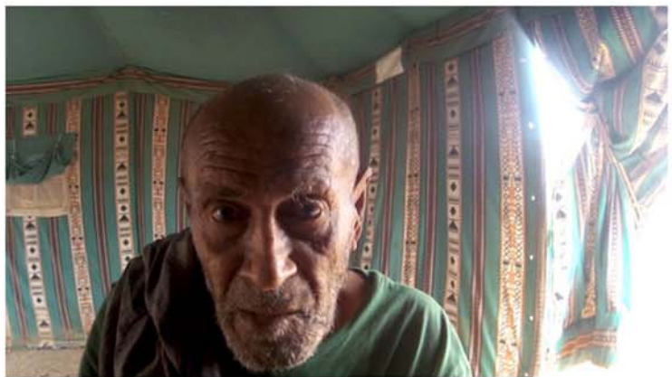
Janet Biggs, Weighing Life Without a Scale, 2018 (detail). Three-channel HD video installation with sound.

You enter by stepping on a projected rainbow of colours splashed on to the floor at the entrance, signalling the crossing into another realm. The theme is walking, movement, with its implications of displacement, relocation and quest. You are struck by all the walking, of people purposefully striding within the screen and from screen to screen as the images flow, the intercutting adding thrust, energy and message.