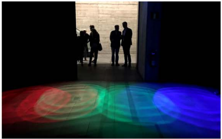
Janet Biggs, Spectrum, 2018. Light sculpture, size variable. Installation view at Museo de la Naturaleza y el Hombre. Courtesy of the artist, Cristin Tierney Gallery, New York, NY, Analix Forever, Geneva, Switzerland, and CONNERSMITH, Washington, DC. Photo: Candace Moeller.

You enter by stepping on a projected rainbow of colours splashed on to the floor at the entrance, signalling the crossing into another realm. The theme is walking, movement, with its implications of displacement, relocation and quest. You are struck by all the walking, of people purposefully striding within the screen and from screen to screen as the images flow, the intercutting adding thrust, energy and message.